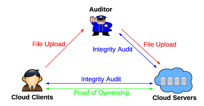
Fig. 1 Overview of System Architecture

file tag to the private server. Private cloud server checks the data owner and computes the file token and will send back the token to the data owner. The data owner throws this file token and a request to upload a file to the storage provider. If duplicate file is found then user needs to run the PoW protocol with the storage provider to prove that user has an ownership of respective file. In the PoW result; if proof of ownership of file is approved then user will be provided a pointer for that file. And on the next case; for no duplicate is found for the file, the storage provider will be come again a signature for the result of that proof for the particular file. To upload file user sends the privilege set as well as the proof to the private cloud server in the form of a request. The private cloud server verifies the signature first on receiving the request for the user to upload file.